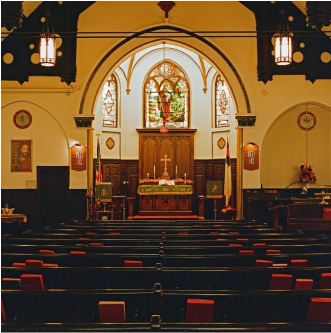
Centennial Memorial's Beautiful Sanctuary