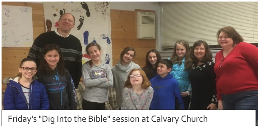
Friday's "Dig Into the Bible" session at Calvary Church